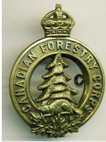
The Canadian Forestry Corps badge.