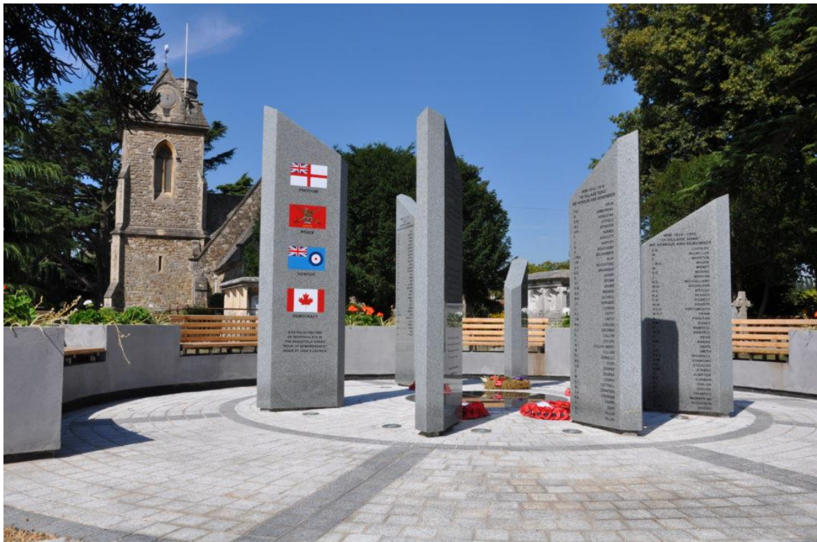
Englefield Green War Memorial (Photo from jsa Architects)