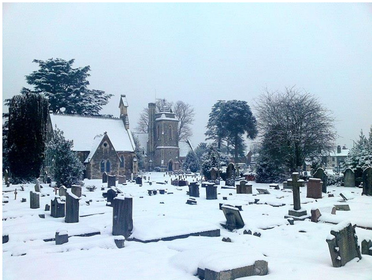
Englefield Green Cemetery

Englefield Green Cemetery contains 94 Commonwealth War Graves – 67 from World War 1 & 27 from World War 2. There are 32 Canadian Graves in the Cemetery. The Canadian Forestry Corps had a hospital at Beech Hill and the Princess Christian Military Hospital was at Englefield Green (in huts).