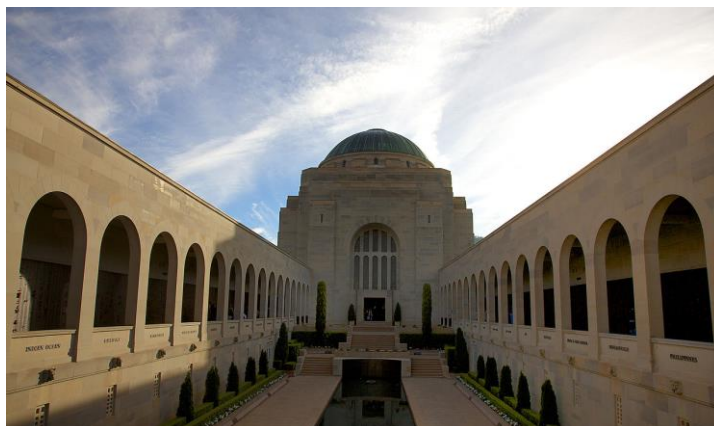
Commemorative Area of the Australian War Memorial