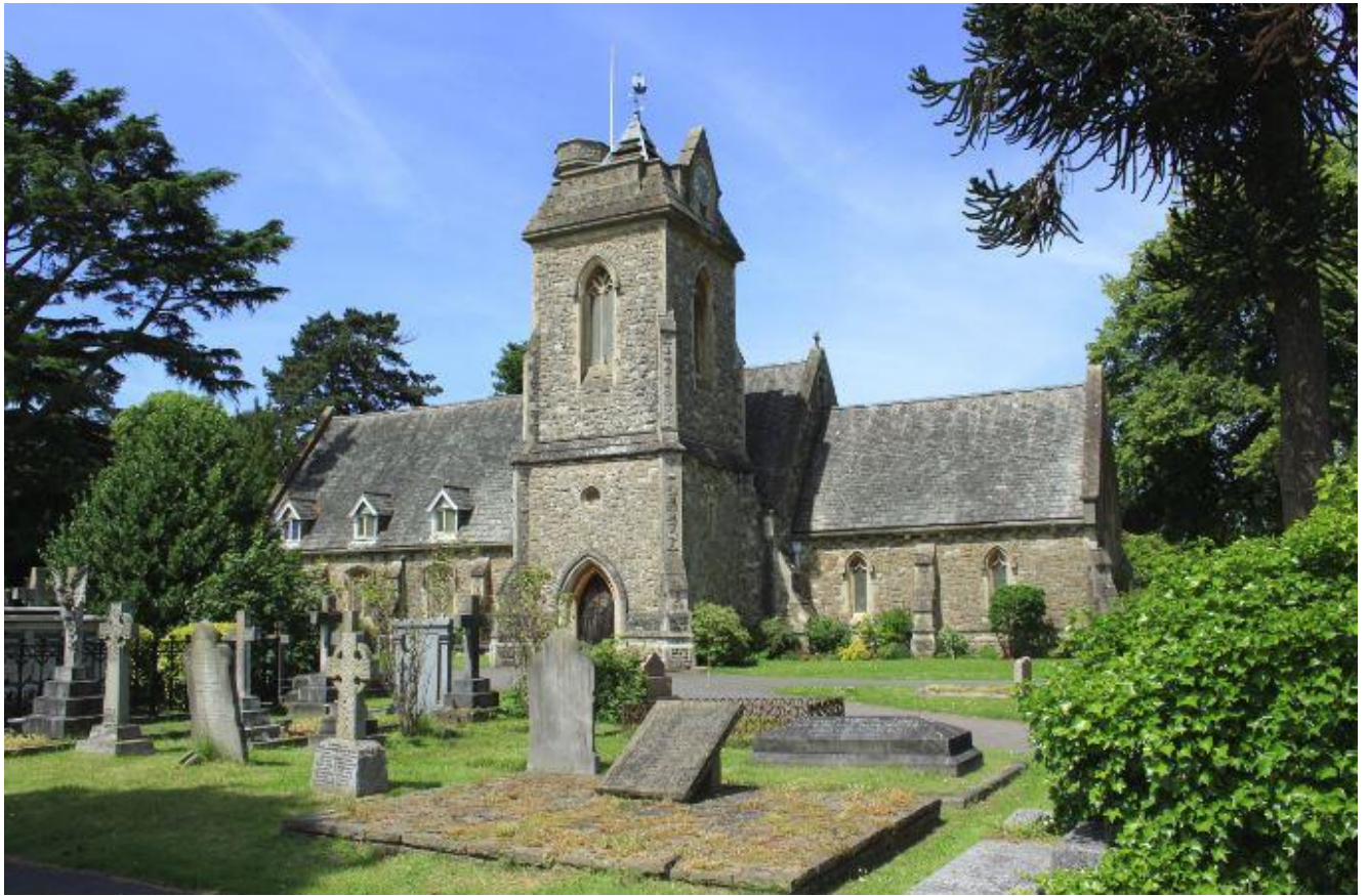
Englefield Green Cemetery