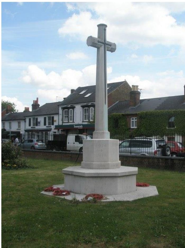
Cross of Sacrifice in Englefield Green Cemetery

Private B. K. Saunders is remembered on the Cross of Sacrifice in Englefield Green Cemetery, Englefield Green, Runnymede, Surrey, England.